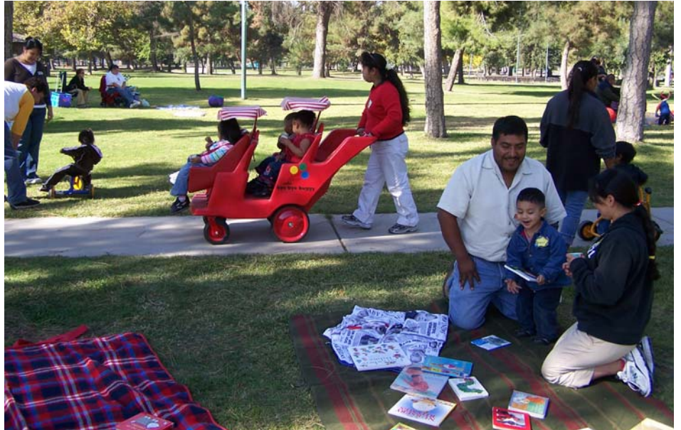
Many families enjoyed their participation in Early Head Start's Grand Socialization held at Roeding Park.