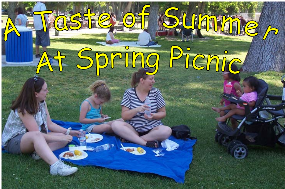
EOC Employees and their children enjoying the shade, while temperatures rose to 102 degrees.