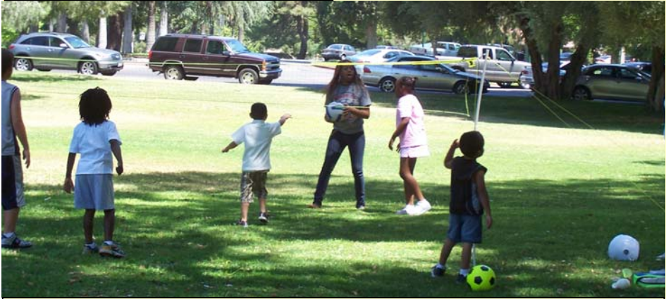
EOC children playing volleyball at Roeding Park's Maple Grove.

zoo animals and colorful licorice treats that EOC employees and their kids could take home after the picnic. All things considered, it was a "HOT and sunny day" but a beautiful day at EOC's Spring Family Day at Roeding Park/Chaffee Zoo.