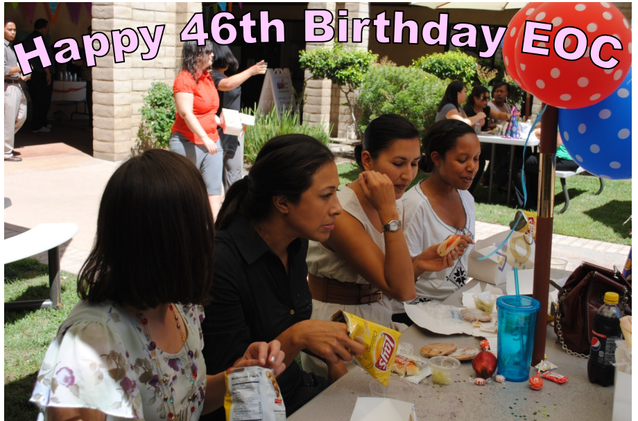
EOC celebrated its 46th birthday on Tuesday, August 30, 2011 with a box lunch for all employees and a gathering in the 1920 Courtyard of the Executive Plaza.