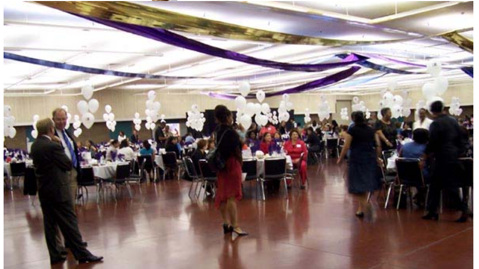
The mood was festive as EOC employees arrive for the party.