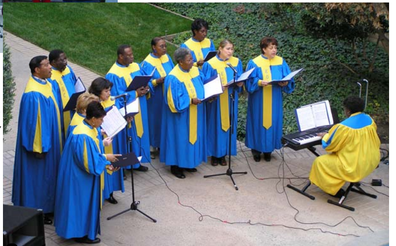
Below—EOC Choir performing at the Paul C. White Memorial dedication ceremony at EOC's Central Office.