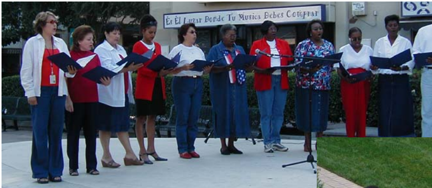
Left—EOC Choir performing at annual 911 Memorial on the Fulton Mall.