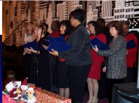
Above—EOC Choir performing at our annual Holiday Party at Banker's Ballroom.