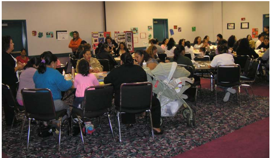
Our Head Start parents participating in a training session put on by our Family/Community Services Program.